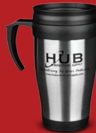
HUB COFFEE MUGS 15 Winners