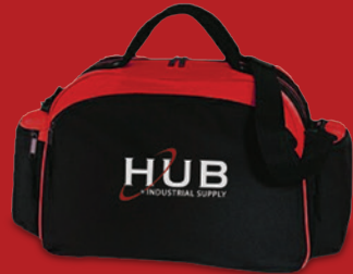
HUB DUFFLE BAGS 5 Drawing Winners

Unfortunately, your clock is unreliable. It loses exactly 24 minutes every hour. It is now showing 3:00am and you know that is was correct at midnight when you set it. The clock stopped 1 hour ago, what is the correct time now?